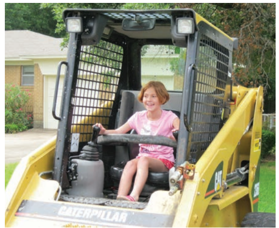
Heavy Equipment Petting Zoo is a unique experience

https://portal.blackboardconnectcty.com/1228101